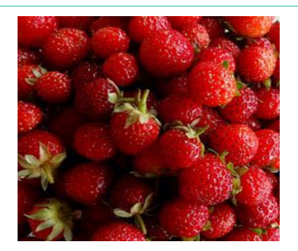
Figure 1: Ottoman strawberry cultivar planted in Karadeniz Ereğli, Zonguldak region of Turkey. (https://acatfromlondon.wordpress.com/tag/ottoman-strawberry).

The objective of this study was to discriminate the genetic similarity of "Ottoman" strawberry cultivar with other local early period strawberry cultivars of Istanbul and Karadeniz Ereğli regions.