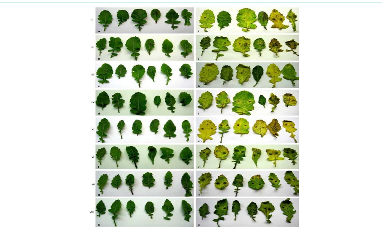
Figure 1: Pathological variation in A. brassicae isolates – (i-viii) ABc-P05, ABc-P06, ABc-P07, ABc-P08, ABc-P09, ABc-P10, ABc-P11 and ABc-P12 respectively, on different host differentials. From left to right - B. juncea var. Varuna, Rohini, Kranti and PHR-01; B. rapa var. YSH401 and Pusa gold. Left (a-h) and right side (i-p) show the healthy and inoculated leaves, respectively.

Assay for evaluation of systemic resistance induced by attenuated virulence was carried out using detached leaf method. A separate assay was carried out for each isolate showing non-aggressive behavior on a specific Brassica variety. The detached leaves from base of 30-day old plant of the respective Brassica variety were inoculated with 10 \mu l of four different suspensions:: sterile distil water as control (C); spore suspensions of non-aggressive isolate; highly aggressive isolate; non-aggressive isolate (on 1<sup>st</sup> day of inoculation) followed by spore suspension of highly aggressive isolate (on 3<sup>rd</sup> day of inoculation). The inoculated leaves were incubated for 10 days at 22 ± 2°C and 12 hr light/ 12 hr dark photoperiod in moist chambers. Host response to pathogen's aggressiveness and disease score was assessed as earlier and data was analyzed statistically for induction of systemic resistance.