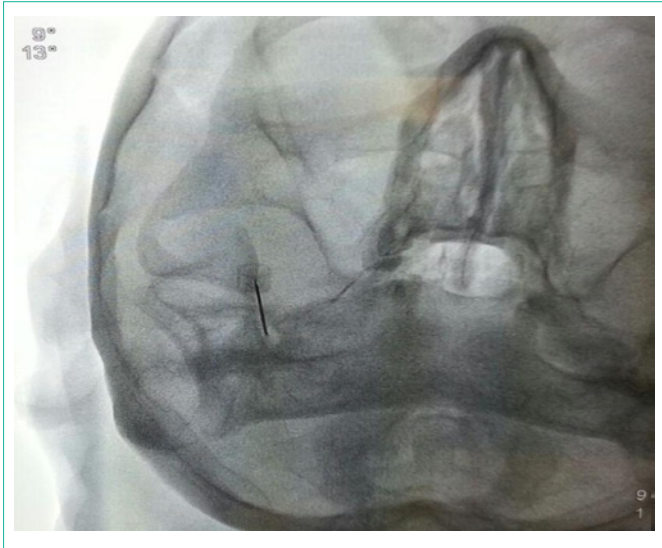
Figure 1: Antero-posterior view of the RF needle entering the foramen ovale.