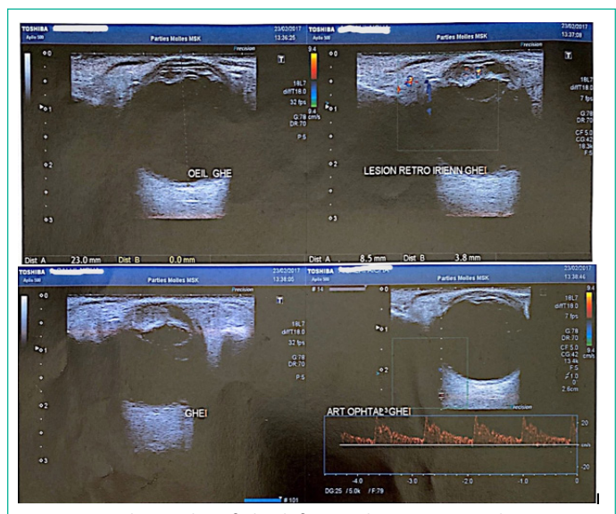
Figure 1: Echography of the left eye showing an oval retro-irian tissue lesion well limited homogeneous hypoechogenic little vascularized with Doppler and measuring 8mm by 4mm, this lesion pushes the crystalline lens out, and the presence of minimal vitreous bleeding without associated retinal detachment. The axial length of 23.5 mm.

Ocular ultrasound showed in the left eye: an axial length of 23.5mm, with the presence of a well-limited homogeneous and hypoechoic oval tissue lesion with little Doppler vascularity and measuring 8mm by 4mm, this lesion pushed the lens outwards, with the presence of a minimal vitreous hemorrhage without associated retinal detachment (Figure 1).