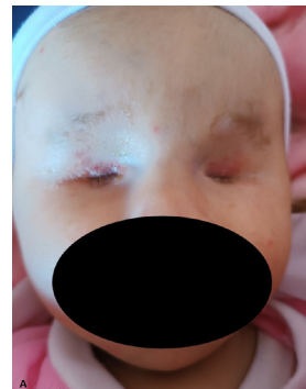
Figure A: Bilateral ankyloblepharon with palpebral collapse related to the absence of the eyeball.

Written informed consent was obtained from the parent for publication of this case report and accompanying images. A copy of the written consent is available for review by the Editor-in-Chief of this journal on request.