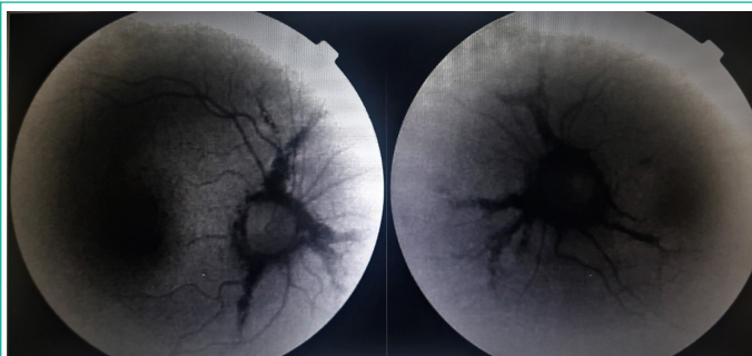
Figure 3: Autofluorescence imaging in both eyes: Angioid streaks visible as irregular lines of reduced autofluorescence running outwards from the optic discs.