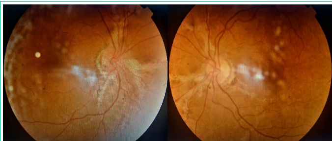
Figure 2: Color fundus photograph in both eyes: angioid streaks emanating from the optic nerve.