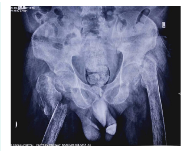
Figure 5: Multiple pathological fracture in the same patient.

any hypolipidaemic drug. He was born of a non-consanguinous marriage without any history of similar disease in the family and without any significant past history of hepatic dysfunction, renal dysfunction, known rheumatological disease or malignancy. The only positive clinical findings were tenderness over bony points and proximal myopathy over all 4 limbs (grade 4-/5) with preserved deep reflexes and intact sensory system. His routine haemogram, ESR, CRP, fasting plasma glucose, renal hepatic and thyroid function test were normal. Serum protein electrophoresis showed no M band. ANA and ENA profile were negative. Serum calcium- 9.8 mg/dl, serum phosphate- 1.1 mg/dl, serum alkaline phosphatase- 518 iu/l, 25 hydroxy vitamin D3- 40 ng/dl (N> 30 ng/dl), 1,25 dihydroxy vitamin D3- 11.2 pg/ml (N= 13-46 pg/ml) and iPTH -36.1 ng/l (N= 10-72 ng/l). 24 hours urinary phosphate was 1.1 g/day (N= 0.465-0.95 g/day) and TmP-GFR was 0.627mmol/l (N=0.65-0.85 mmol/l) with normal 24 hours excretion of calcium, uric acid, glucose and protein. X-ray pelvis showed multiple Looser's zones (Figure 4). He was diagnosed as a case of hypophosphataemic osteomalacia. He was suspected as a case of tumour induced osteomalacia but 18F FDG PET-CT scan was normal at that time. He was prescribed with high dose active vitamin D and oral phosphate salt but he left treatment and discontinued follow up. 2 years later he came in bed-bound state with multiple fractures in pelvis (Figure 5) with almost similar