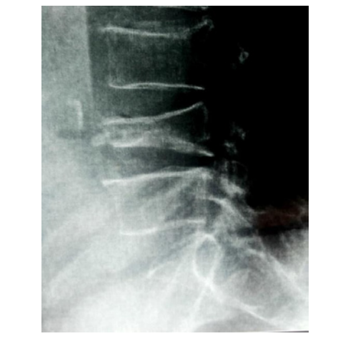
Figure1: L4 vertebral pathological fracture in a patient of multiple myeloma.

primary tumor, severity and extent of bone involvement and early diagnosis and intervention [2].