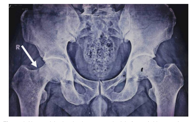
Figure 4: X-ray pelvis showing looser zone in right femur (white arrow).

A 58 year old male patient office clerk by occupation, presented with history of aches and pains all over the body, dull aching in nature for last 2 years which started as low backache but gradually involved shoulder, chest wall and hips. He also complained of difficulty in standing up from squatting position, climbing upstairs and taking over-head office files for last 18 months. The pain was not associated with any arthritis or arthralgia, prolonged fever or any other neurological symptoms. He was a non-vegetarian with daily intake of milk and adequate sun exposure. He was a non-smoker, nonalcoholic without any history of substance abuse. There was no past history of steroid intake and he was not on any regular drug including