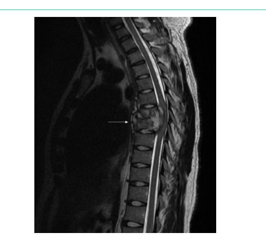
Figure 1: MRI Thoracic Spine with contrast. Arrow indicates a peripherally enhancing collection in the T6-T7 disc space.