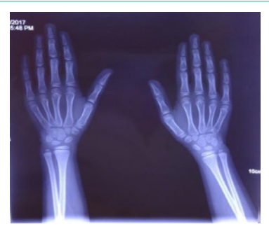
Figure 2: Broad thumbs, broad terminal phalanges were absent.

for the patient. While treatment, behavior modification techniques were used like Tell-Show-Do (TSD), physical restraints with the positive reinforcement and involvement of mother.