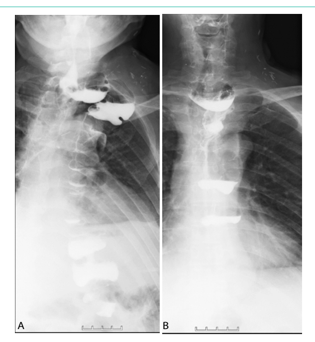
Figure 3: (A) Esophagography shows herniation of the colonic graft to the left neck 8 days after the CPR. (B) Esophagography image at the 2-month follow-up after shortening of the colon segment at the neck.