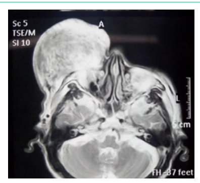
Figure 1: Magnetic resonance imaging (MRI) of the mass lesion.

Kimura's disease is a rare disease entity and the disease manifesting with a giant mass that occur in the infraorbital region is extremely rare. The pathogenesis of Kimura's disease remains uncertain. Many scholars believe it to be an allergic reaction or Parasitic to an elevated