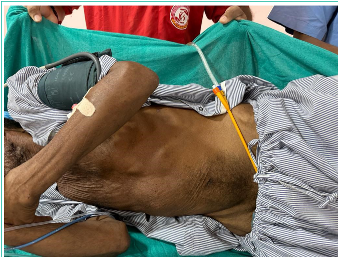
Figure 1: Log Rolling Technique for patient.

and any adverse effects e.g. nausea, vomiting, urinary retention, nasal congestion were noted.