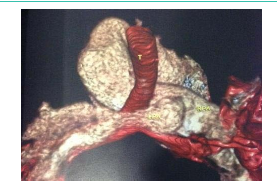
Figure 1: Showing vascular sling of LPA posterior to the trachea (T) causing pressure changes.

Keywords: Fast Track; Pulmonary Artery; Sling