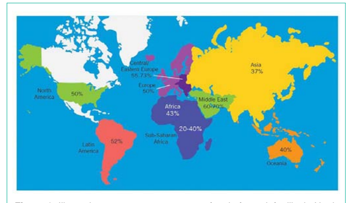
Figure 1: Illustration represents percentage of male factor infertility in North America, Latin America, Africa, Europe, Central/Eastern Europe, Middle East, Asia, and Oceania. The image was adapted from Agarwal and others (2015), reviewing the male infertility around the globe. Reprod Biol Endocrinol. 13:37 [2].