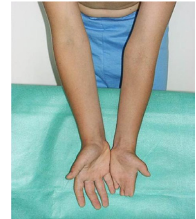
Figure 1: Patient with the classic deformity (brachysyndactyly) (type 3B).

From the group of 19 patients only 8 (5 females and 3 males) were