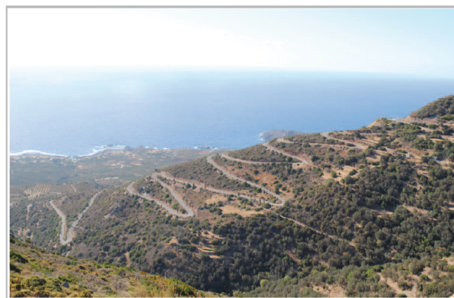
Figure 1: Coast line and olive trees, western crete.

The species that grows on the island and the elevation (when known) that each species preferentially grows at are described in a table which is provided separately [5].