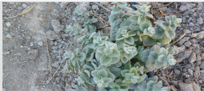
Figure 8: Origanum dictamnus »diktamos«.