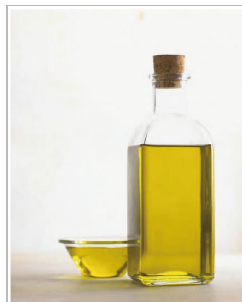
Figure 5: Olive oil - Legendary in Crete.

products are ready for the market. With the knowledge of the olive and the know-how of the processes to extract the olive oil and all the by-products of this process, the olive could become the fundamental pillar of the »Cretan Cosmetics«.