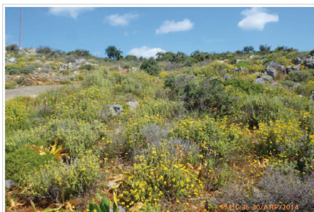
Figure 2: Typical vegetation, Phrygana.