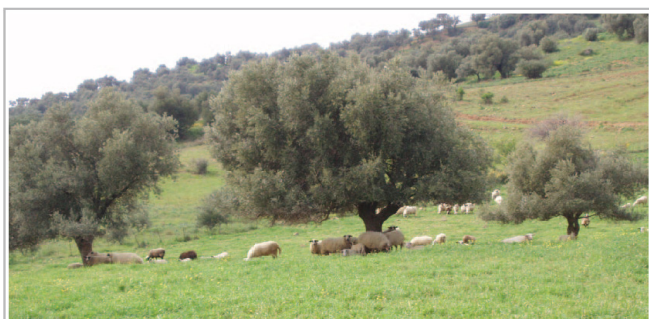
Figure 6: Olive tree.

In the grape itself 30 % of the polyphenols are found in the husk, 10 % in the pulp and 60 % in the seed [17]. From 1 ton of grape seeds 1 kg of polyphenols can be obtained. Additionally, this product can be obtained from the vine as well. In wine production first a mash is made. For manufacturing of red wine the pomace is separated after the fermentation, while the pomace is not fermented for the production of white wine.