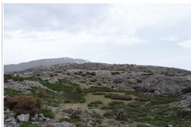
Figure 3: Mounatain of Psiloritis.