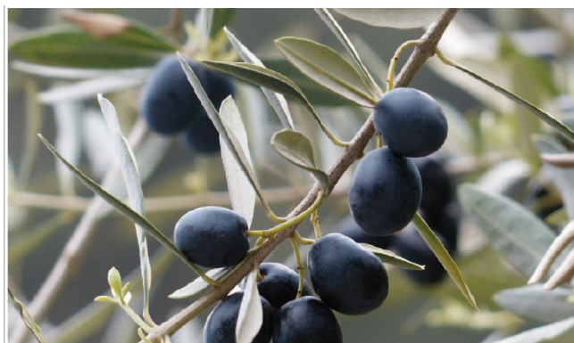
Figure 4: Cretan Olives.

When thinking about typical Cretan products, the first is the valuable Cretan olive oil. The cultivation of olives has an amazing history of more than 5,500 years on the island. On average every resident owns 30 trees. In total about 20 million olive trees are said to grow on about 44 % of the arable land. With this amount of trees every year 150,000 to 180,000 tons of olive oil are produced. The weight of harvested olives is even higher, since 4–7 kg of olives are needed to produce a litre of oil. Every tree carries about 20 kg of fruits [10]. The world-wide olive oil production is about 2.9 million tons. 95 % of the 750 million olive trees grow in the mediterranean area, 40 % thereof in Spain. Greece is the third largest producer [11]. The most olive trees in Crete are of the species »Koroneiki« (80–90 %), but in some districts there are rare species such as the »Tsounati« olive. An olive of the species »Koroneiki« has an oil content of about 22 %. This represents about 0.5 g oil. In addition to the oil the olive consists of water (50 %), sugar (19.1%), cellulose (5.8%) and proteins (1.6 %) [10].