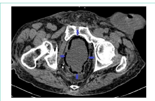
Figure 1: Abdomino pelvic CT axial slices scan showing parietal bladder air bubbles (blues arrows).

It is secondary to an aerobic glucose metabolism, which leads to the production of CO_2 . This leads to parietal emphysema by parietal gas dissection, which can spread in severe forms to the peri bladder cellulo-fat space. Not recommended for diagnosis, the abdomen without preparation may find pneumovesia or pelvic hydroaeriosis. Ultrasonography shows parietal bladder air bubbles with shadow cones. The CT scan shows multiple diffuse circumferential air bubbles in the bladder wall without digestive fistula (Figure 1; Figure 2: blues arrows). The germs involved are aerobic and anaerobic, but especially Escherichia Coli and Klebsiella pneumoniae. The prognosis depends on the early diagnosis and antibiotic treatment.