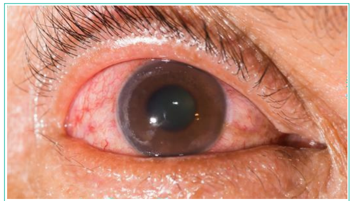
Figure 2: Neo vascular glaucoma.