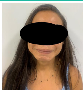
Figure 1: Patient with the inverted face sign that is pathognomonic of Ochoa Syndrome.